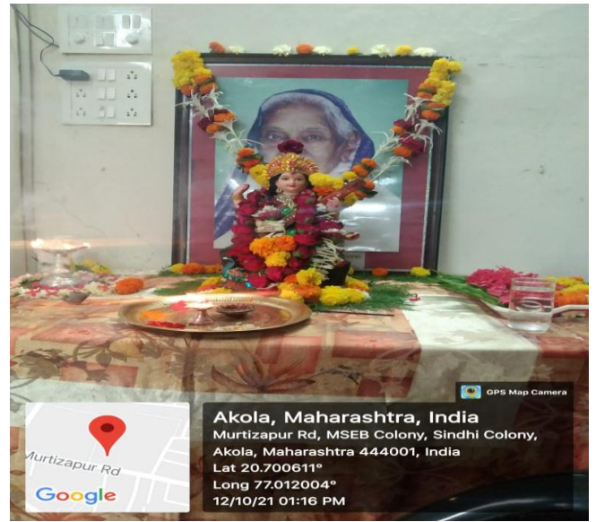
Sharda Sthapana and Pooja